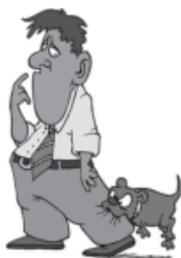
(When a dog bites a man- Normal Incident)

In the railway station, we might have noticed the board displaying the train timings. That is not news. That is information. Information becomes news when news value is added to it. For example, if a new train time table is issued by the railways replacing the existing one with changes in train timings then that becomes news. Similarly, the different slab of income tax rates is not news. But when the government decides to increase or lower the rates, it becomes news.