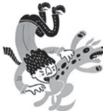
(When a man bites a dog- Special Incident with News Value)