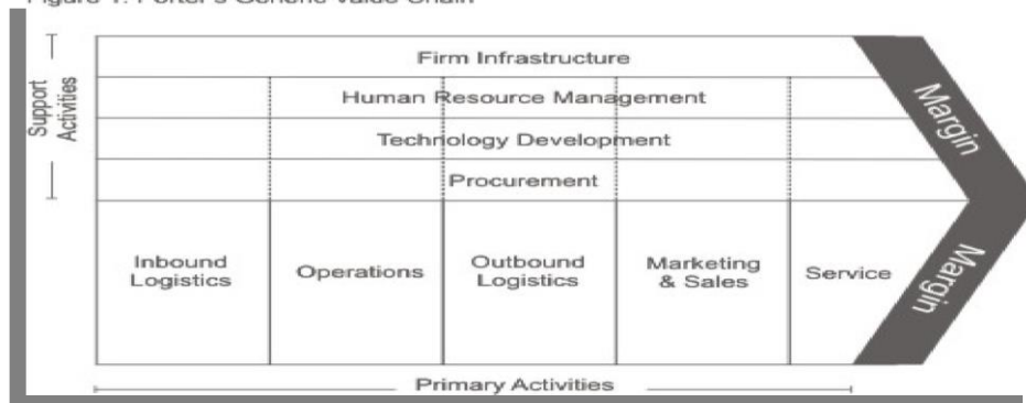
Figure 1: Porter's Generic Value Chain

consumers. Using this viewpoint, Porter described a chain of activities common to all businesses, and he divided them into primary and support activities, as shown below.