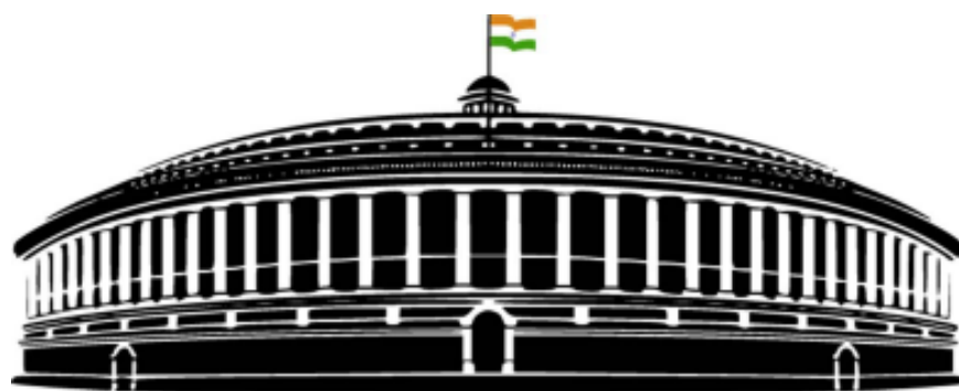
— PARLIAMENT OF INDIA —