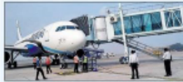
An IndiGo aircraft at Bhubaneswar airport.

The third new IndiGo flight will reach Bhubaneswar at 8.05am and leave